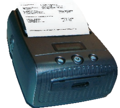
Option: wireless printer used to print the measurement results on site. Perfect solution for quick audits.