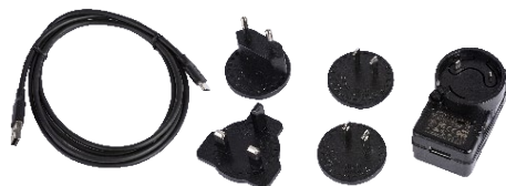
USB charger with USB-C cable