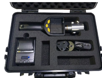
The included transport case protects the measurement instrument. At the same time it holds all accessories.