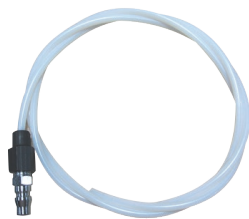
PTFE hose with quick connect