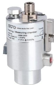
Unique measuring/parking chamber for fast sensor response