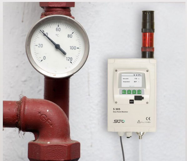
optional alarm unit mounted on the housing